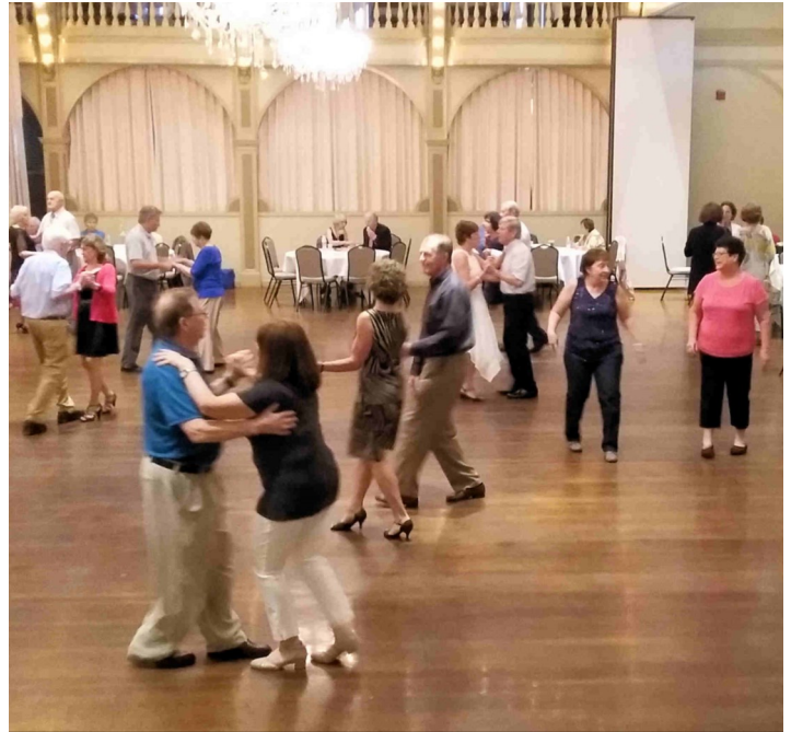
Dancers enjoying the evening in the ballroom at Rhodes-on-the-Pawtuxet.