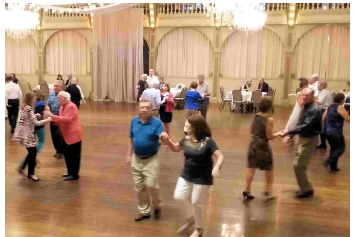
A lively number has the dancers swinging and swaying around Rhodes beautiful ballroom.