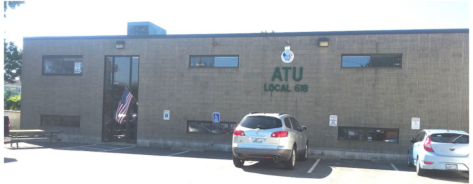
Photo above shows the building that we now share with our hosts, Local 618 of the Amalgamated Transit Union. We are now located at 172 Longfellow Street, Providence, RI 02907-2621 and our new phone numbers are (P) 401-780-6887 and (F) 401-780-0556. Please see the article on page 4 of this issue for more info.