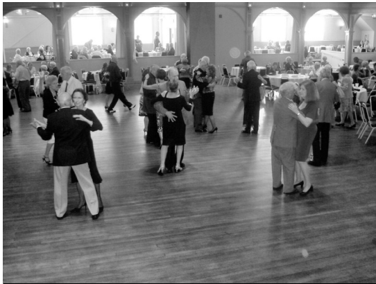
Dancers in the Rhodes ballroom at the Cavalcade of Bands on May 24.