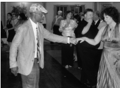
Dancers fill the floor in the foyer of Rhodes.