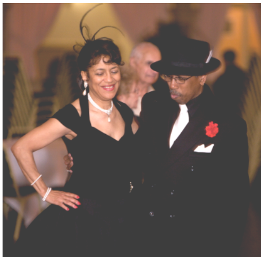
Dancers in period costumes highlight the evening.