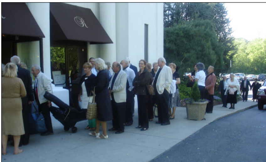
Patrons queue up to enter Rhodes-on-the-Pawtuxet for the Cavalcade of Bands held on Tuesday, May 19. Story on Page 5. More photos on page 10

Please help out here: remember, we are raising funds for our Local to avoid any dues increases and to keep our Local strong.