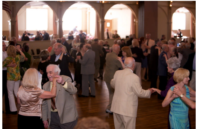
Dancers crowd the floor of the ballroom.