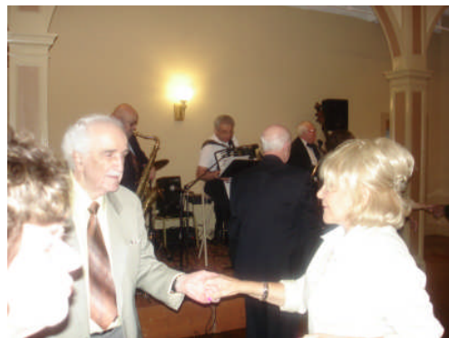
Dancers jitterbug to the music of The Nomads.